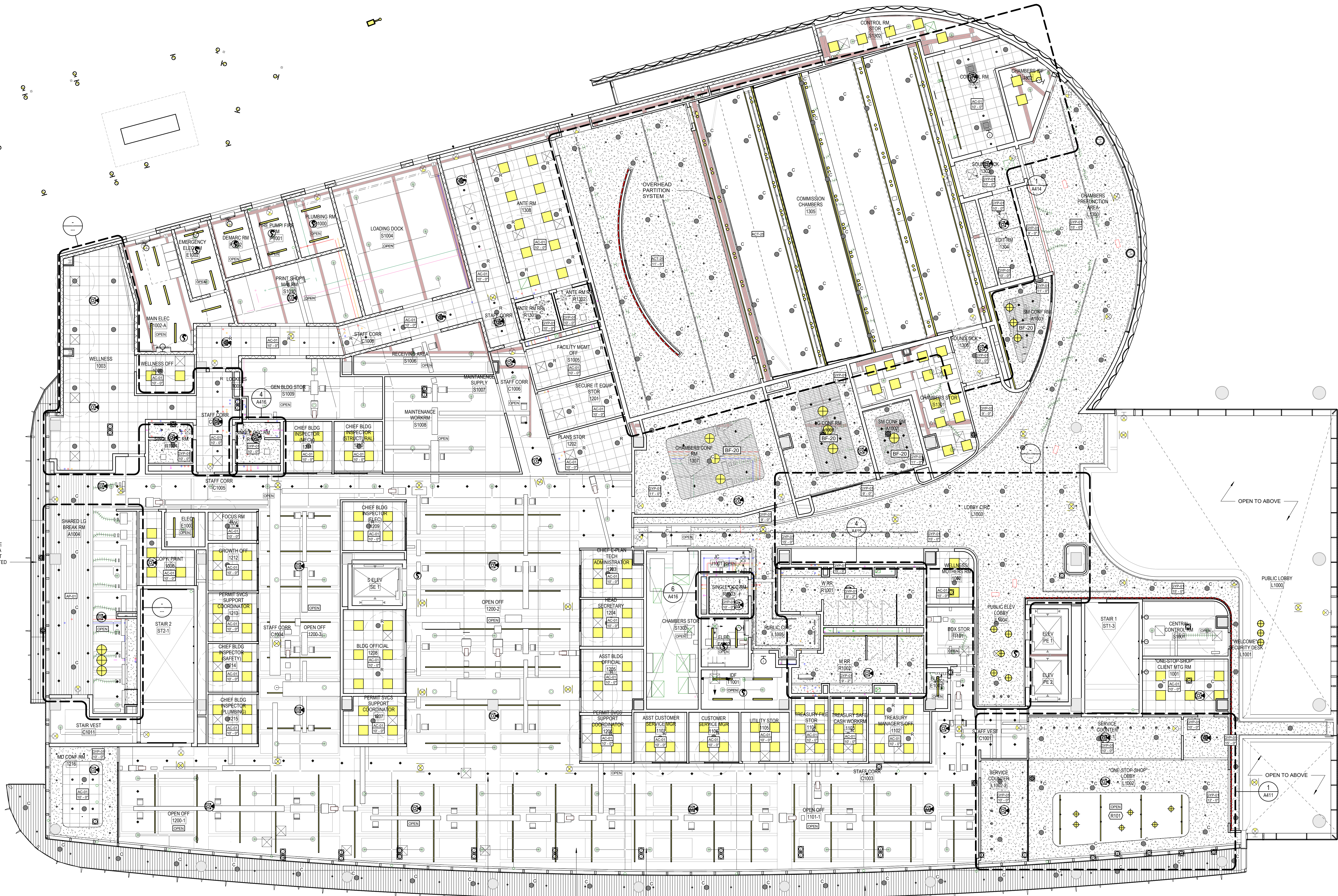
1 REFLECTED CEILING PLAN - LEVEL 1 1/8" = 1'-0"